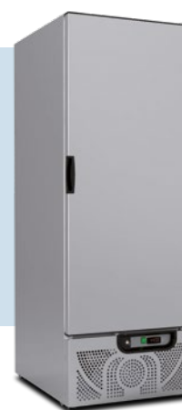
CHEF 600 NX